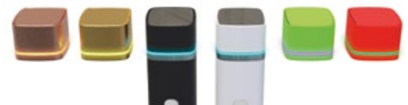
Multiple Trim Colour Options