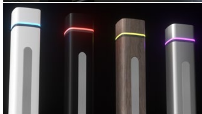
Multiple Custom Wrap Options